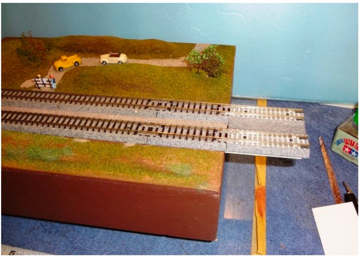
Finally, in Photo 4 you can see how the tool adjusts the edge of the track 1mm beyond the edge of the module. This allows the separation between modules to be 2mm, the standard separation.

In Photo 3, you see one of the completed alignment jigs. I built a second one following the same steps so I could align both ends of the track at the same time. The styrene strips, which extend 1mm beyond the end of the track, are apparent underneath, as are the screws that are holding the strips in place.